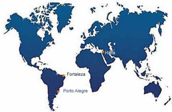
Figure 1. Teams setting

One of the issues identified during this research was the chronological dispersion. Israel and Brazil are separated by a 5-hour time zone difference (as represented on Figure 2), reducing communication window and time for solving doubts.