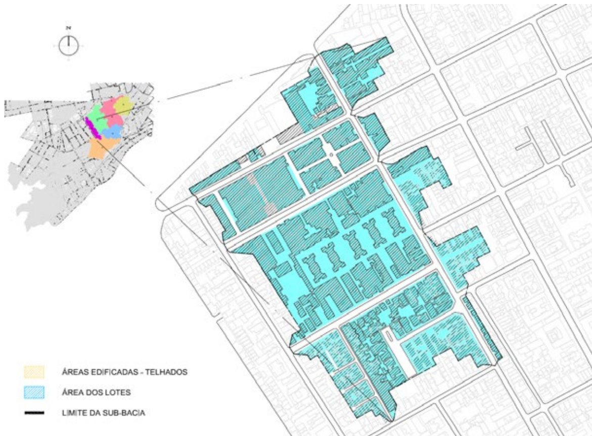
Figure 4. Component areas of the sub-basin C of Area 1. Tijuca Region f, Rio de Janeiro, Brazil, 2018