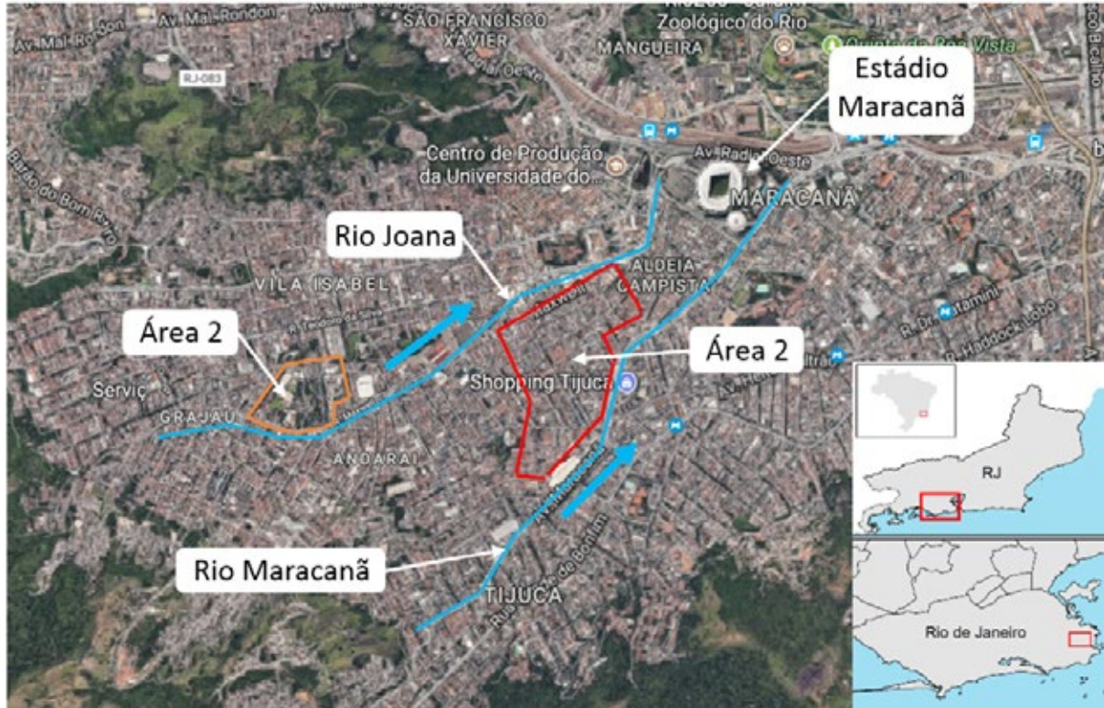
Figure 1. Location/situation of the area prioritized for the study (Tijuca), including its main water bodies: Joana and Maracanã rivers. Rio de Janeiro Brazil, 2018