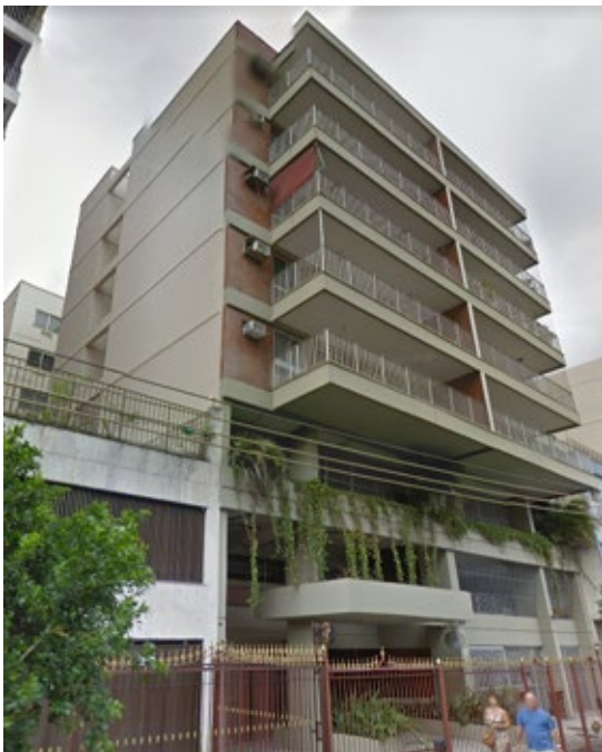
Figure 5. Building located at Rua dos Artistas of the sub-basin C of Area 1. Tijuca Region, Rio de Janeiro, Brazil, 2018

the implantation of the technique of lots inside micro-reservoirs, with the objective of damping flood peaks and, secondly, reusing stored rainwater;