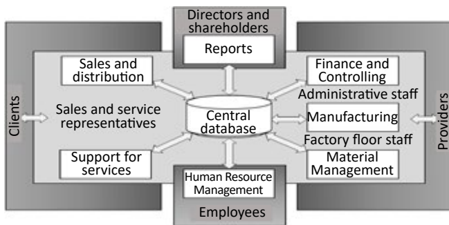
Figure 1 - Typical operating structure of an ERP system.

To illustrate the definitions exposed so far, Figure 1 shows the working architecture of an ERP system, based on the view of Davenport (1998). The author states that at the core of an ERP system is a database that receives and delivers data to applications that support the activities of a company. Thanks to the use of a central database, the flow of information becomes drastically more agile.